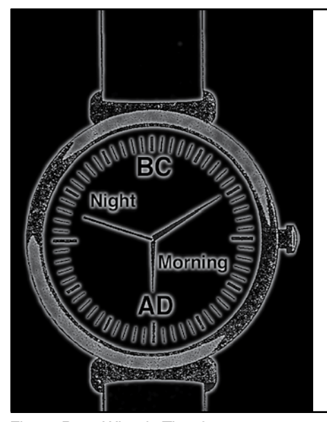
Time is a progressive measure between two or more events. It can be linear or non-linear. That is, events between can be equal or unequal time.

Dealing with subjects so difficult that they are rarely touched by others, it is not to be considered strange if some of the suggestions made in this Volume have not been fulfilled with absolute accuracy to the very letter. But the author, the publishers, and the thousands of readers of this Volume are not ashamed of its presentations, and are still handing it forth to all who have an interest in Bible study—as most interesting and most helpful in an understanding of the Lord's Word.